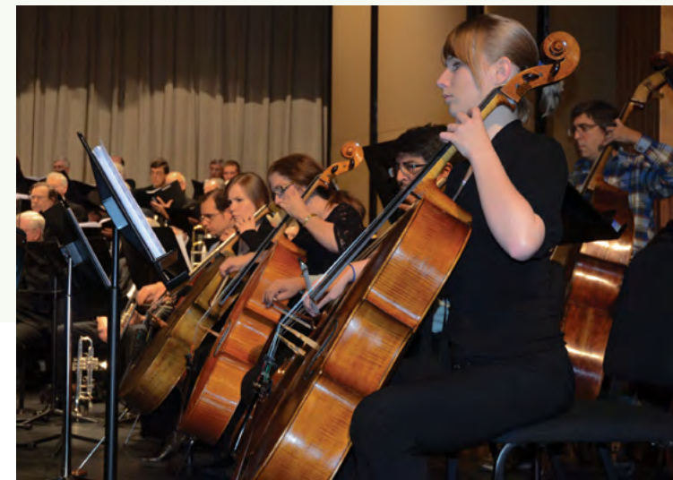
Symphony of the Hills - $10,000 Players rehearse with the Grand Symphony Chorus prior to the holiday concert.