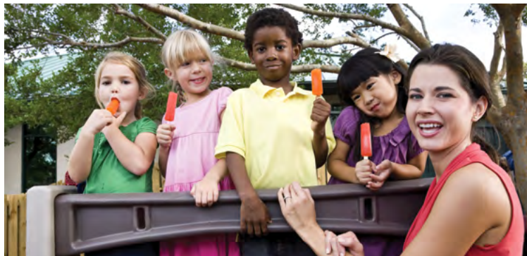
A Child's Place Learning Center in Kerrville - $30,000 Children enjoy a popsicle break outside.